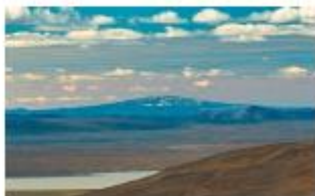
A shield volcano

Volcanoes erupt when magma rises to the surface