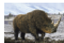
Woolly rhino (extinct)