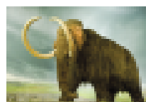
Woolly mammoth (extinct)